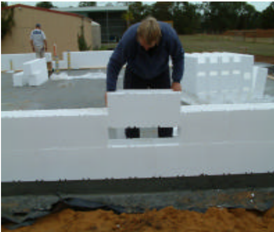
Insulbrick interlock like “lego”.