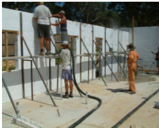
Formwork is braced and filled by pump.