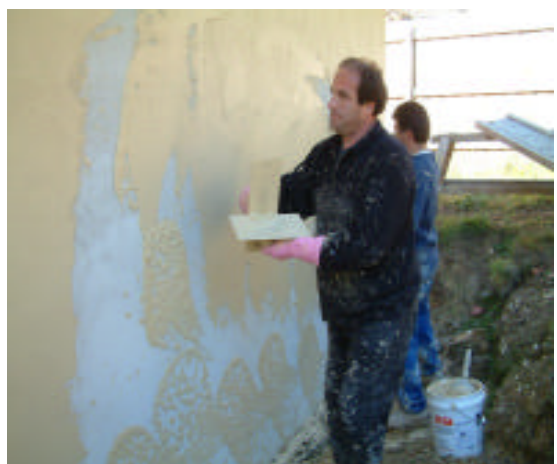
All external finishes are possible, render is popular.