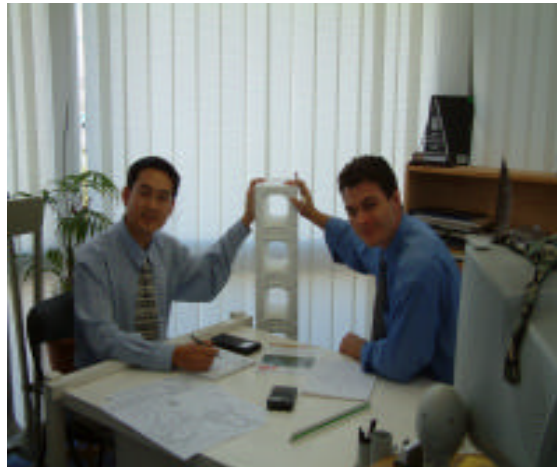
Our Engineers provide full reinforcement specifications for all wind areas.