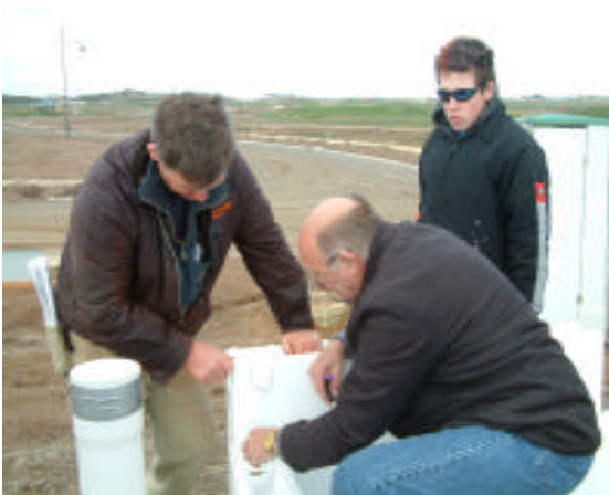
Comprehensive on site instruction.